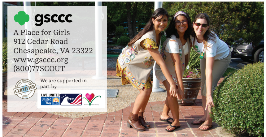
Personalized bricks and benches are placed in the courtyard of the GSCCC headquarters to commemorate all those that have shared their time and treasure with GSCCC. Information: philanthropy@gscce.org